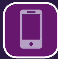
INT APP Courts

In addition to this guide, we have Intervention applications available on our website ( www.wwmcrc.co.uk ) to help those who work in the Criminal Justice System