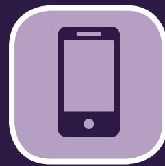
INT APP Offender Management

Address: The Warwickshire and West Mercia Community Rehabilitation Company Limited (WWM CRC Ltd), Elgar House, Shrub Hill, Worcester, WR4 9EE.