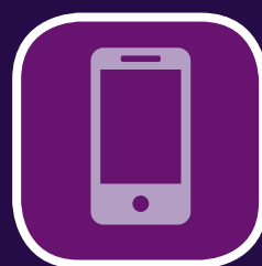
INT APP Courts

In addition to this guide, we have Intervention applications available on our website ( www.wwmcrc.co.uk ) to help those who work in the Criminal Justice System