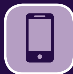
INT APP Offender Management

Address: The Warwickshire and West Mercia Community Rehabilitation Company Limited (WWM CRC Ltd), Elgar House, Shrub Hill, Worcester, WR4 9EE.